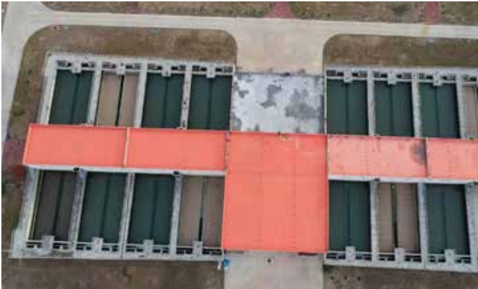
Project Name: Padma Jashaldia Water Treatment Plant Rooftop Location: Munshiganj Scope: Rooftop waterproofing and heat reflecting coating