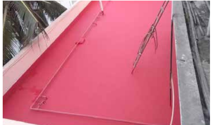
Project Name: Mimi House Location: Uttara Work : Waterproofing and Heatproofing work