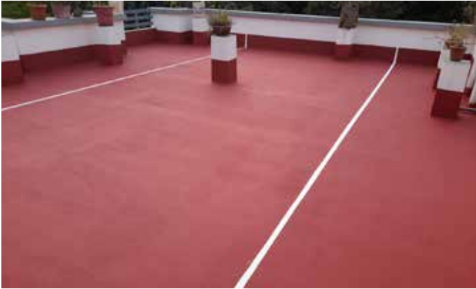
Project Name: SARA Residential Building Location: Gaibandha Sadar Scope: Waterproofing and Heat Reflecting work