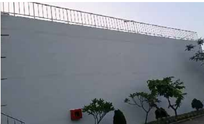
Project Name: Savar-Keraniganj Wellfield Plant Location: Aminbazar Work: Fair-face skim coating