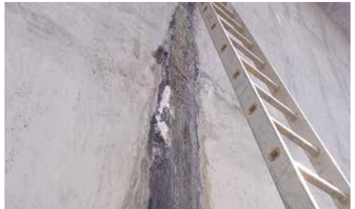
Project Name: Savar-Keraniganj Wellfield Plant Location: Aminbazar Work: Liquid treatment work