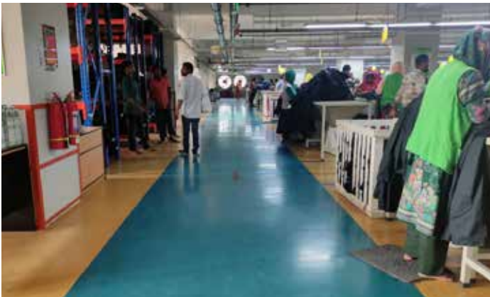
Project Name: Saleha Textile Limited Company Name: Magura Group Location: Valuka Work: PU flooring