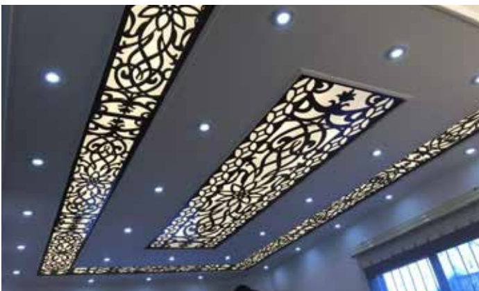
Project Name: Brothers House Location: Jessore Scope: Gypsum decoration work