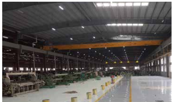
Project Name: Ananda Jute Mills Limited Location: Faridpur Work: Epoxy flooring work