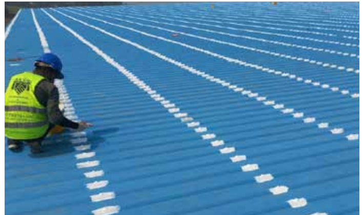
Project Name: Magura Group Agricultural Firm Location: Ashulia Work: Tin shed waterproofing work