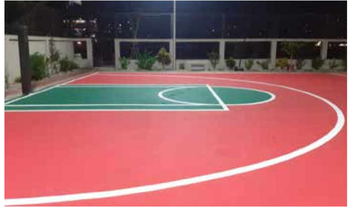
Project Name: Rangpur PWD Staff Complex Tennis Court Location: Rangpur Scope: Sports flooring