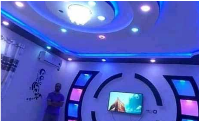
Project Name: Private House Location: Barishal Work: Gypsum decoration work